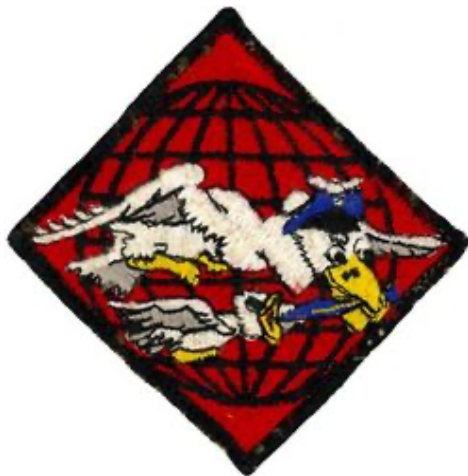
622 Air Refueling Squadron emblem: A caricatured pelican feeding a baby pelican a fish, superimposed on a globe. (Approved, 15 Jun 1956)