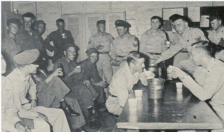
Taking a break the Coffee Shack behind Operations, England AFB, LA, 1955