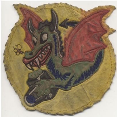
22 Photographic Squadron emblem