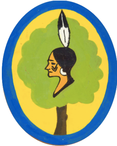
22 Photographic Squadron emblem