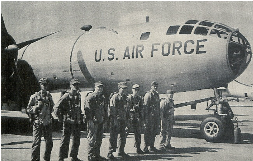
Flight crew ready for inspection, England AFB, LA, 1955.